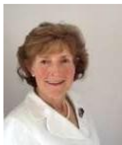
Ruth Guy Lay Chair