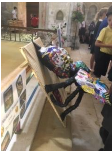
A giant bee adorns the canvas made by pupils at St Luke's School, Bournemouth.