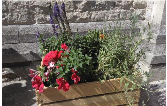
Polinator flower boxes adorn Portsmouth Cathedral.