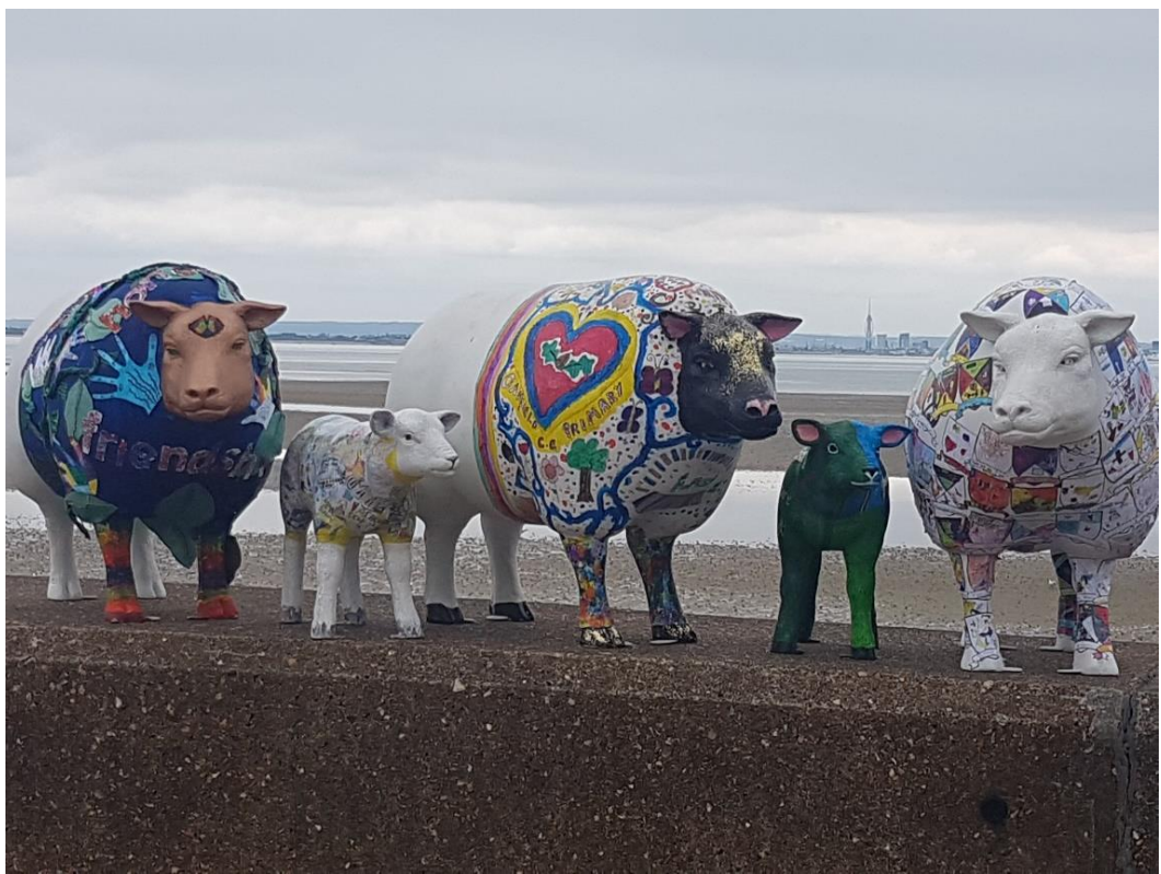
Then lining up ready to set sail.....