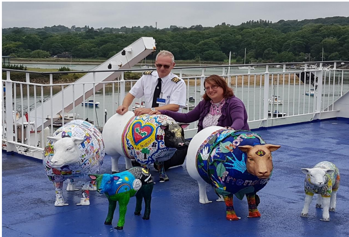
And finally a selfie with the priest and captain!