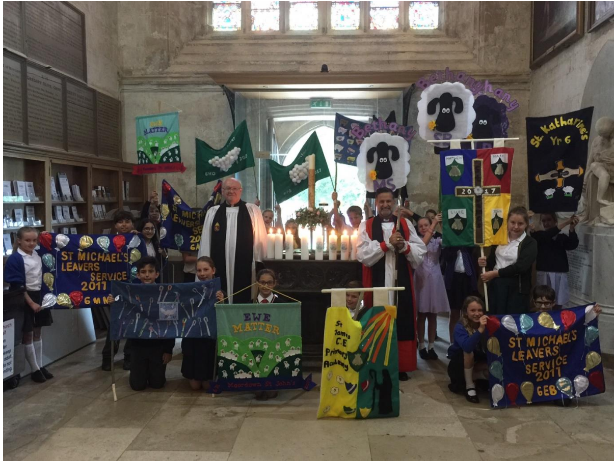
The beautiful interior of Christchurch's 900-year-old priory provided a dramatic backdrop to the banners representing each school.

The services at the end of June and throughout the first week of July, were held during the hottest days of the year. Children ate and played outside during lunch breaks at the services.