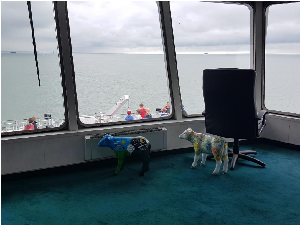
The view from the bridge.....