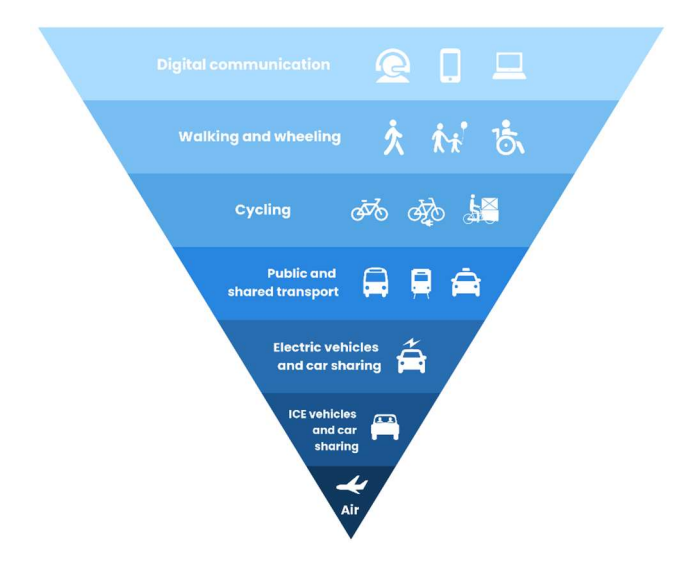
Figure 4. The sustainable travel hierarchy <sup>10</sup>.