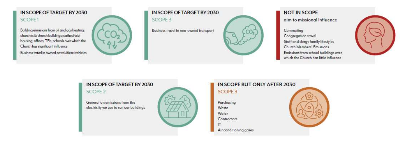
Figure 1. Areas of emissions that are in and out of scope for the Net Zero target.