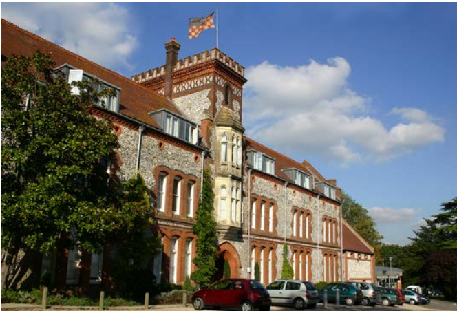
Winchester University FORMERLY KING ALFRED COLLEGE

This Diocese has been a major engine of Christian learning and education, from the time of King Alfred onwards, through the establishment of schools and abbeys, churches and priories.