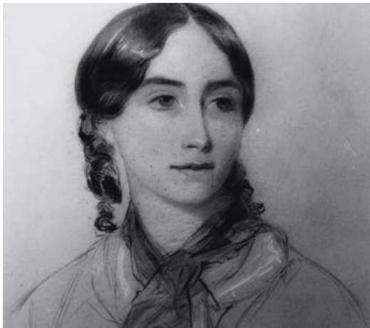
Mary Sumner FOUNDER OF THE MOTHERS' UNION

This Diocese has been a major engine of church growth and of mission, as parish churches, priories and abbeys were planted across the beautiful landscape we still enjoy today.