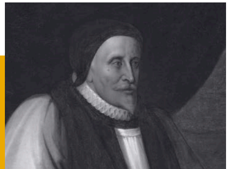
Bishop Lancelot Andrewes BISHOP OF WINCHESTER 1619-1626

Bishop Lancelot Andrewes oversaw the translation of the Authorised Version of the Bible, work which reshaped our language and formed a people of faith, hope and love.