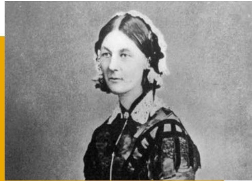
Florence Nightingale SOCIAL REFORMER

It was compassionate love, for example, that motivated Florence Nightingale, raised and buried in this diocese at Embley near Romsey, to defy social convention to train as a nurse and then to travel to the Crimea to care for soldiers in appalling conditions.