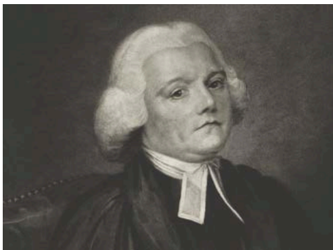
Gilbert White PARSON • NATURALIST

Similarly, it was a love of creation that caused Revd Gilbert White, the pioneering naturalist and vicar of St Mary's, Selbourne, to study nature in such depth, transforming the way we look at the natural world, such that he is often described as being the father of ecology – an example to inspire us as we look to the future and take seriously our legacy to God's creation.