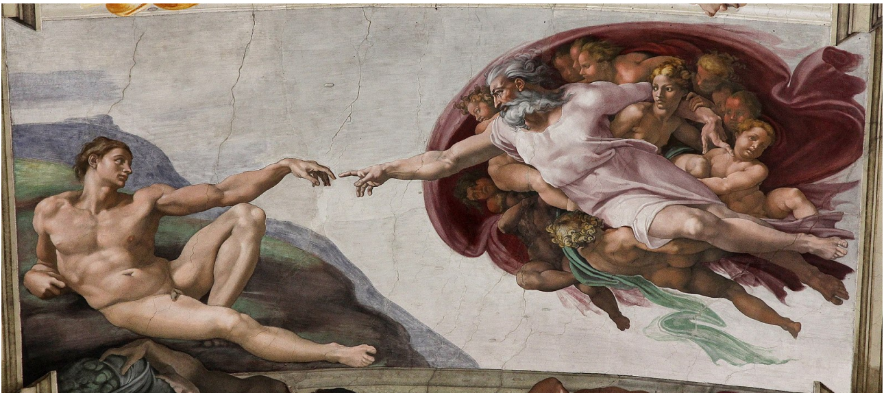
'The Creation of Adam', Sistine Chapel, Vatican, Michelangelo.

A key image in Western art. How does this image relate to imago Dei ? The Sistine Chapel website says: 'Michelangelo was inspired by the Genesis phrase "God created man in his own image"'. In light of your reflections for Session 2, what do you make of this depiction?